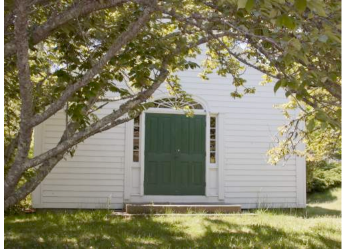
The Hurd Chapel will be relocated nearer the Meetinghouse to make it more functional year-round for exhibits, meetings and workspace, with storage underneath.

Our plans call for moving the Hurd Chapel further up the hill, turning it 90 degrees and placing it on a permanent foundation with a walk-out basement underneath. This will better integrate it with the Meetinghouse. Modern lighting, HVAC systems and two restrooms will greatly increase our ability to preserve and exhibit artifacts, host smaller events