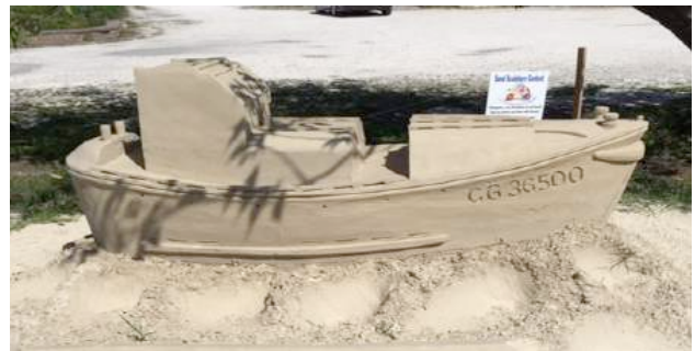
This sand sculpture of the CG36500 was part of the 2016 Yarmouth Summer Celebration.