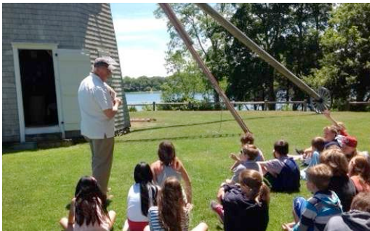
Orleans' fourth graders learn about the Jonathan Young Windmill during "History Day" in June, hosted by OHS.