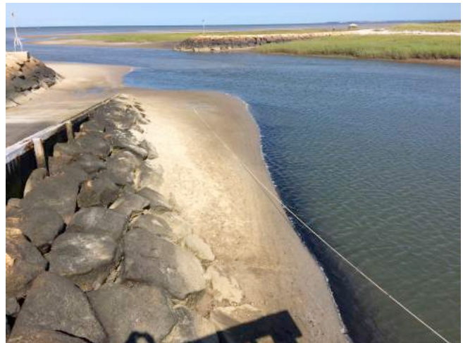
Spare anchor line is tied to buried anchor for extra safety.

Our winter berth at Meeting House Pond is much better protected and doesn't have the tidal range that Rock Harbor has. But there have been instances of storms flooding the parking lot at Nauset Marine East. So we have to decide how to handle the risks wherever we might be.