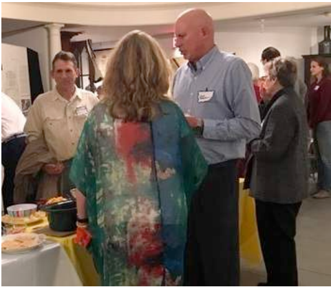
OHS members enjoy talking with each other and sampling the food at the member reception (left).