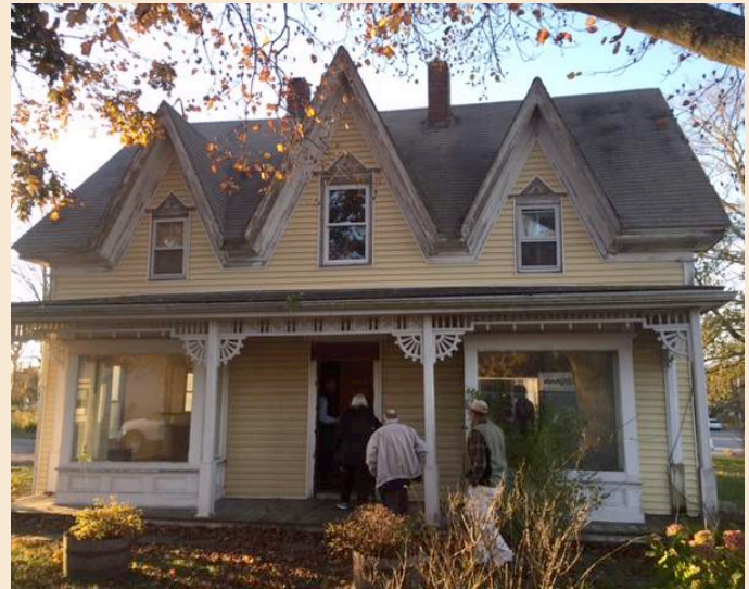
OHS Board members recently toured the Bassett house on Cranberry Highway.