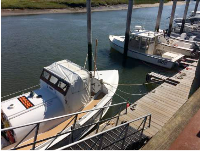
Extra mooring lines secure the CG36500 for severe weather.

The history of hurricanes affecting Orleans, and specifically Rock Harbor, is somewhat lacking to me as I have only been involved with the CG36500 for 16 years. However, I experienced hurricanes in 1944 and 1954 in Chatham.