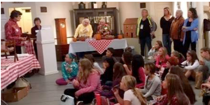
Orleans students visited Town Hall, OHS and other places of interest during Heritage Day (below).