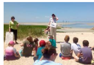
4th Grade History Day