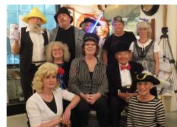
The Girl from Quanset, operetta