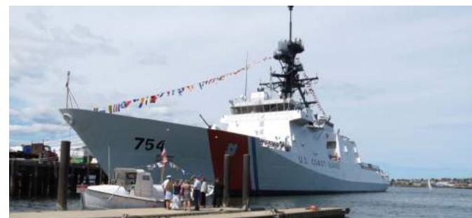
CG36500 next to the USCG cutter James in Boston Harbor during the Commissioning ceremonies on August 8