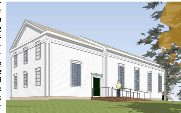
Artist concept of Meeting House addition (left) by Flat Hills Design

Design plans have been announced for adding much-needed space to the 1834 Meeting House on River Road, home of the Orleans Historical Society (OHS) and the centerpiece of its vision for a Heritage Center serving Town residents and visitors well into the future. The 24-by 30-foot addition on the northwest end of the Meeting House, mirroring the existing historic architecture and scale, will provide handicap access and restrooms, plus expanded preservation space for artifacts.