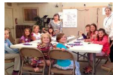
Kids at the Museum