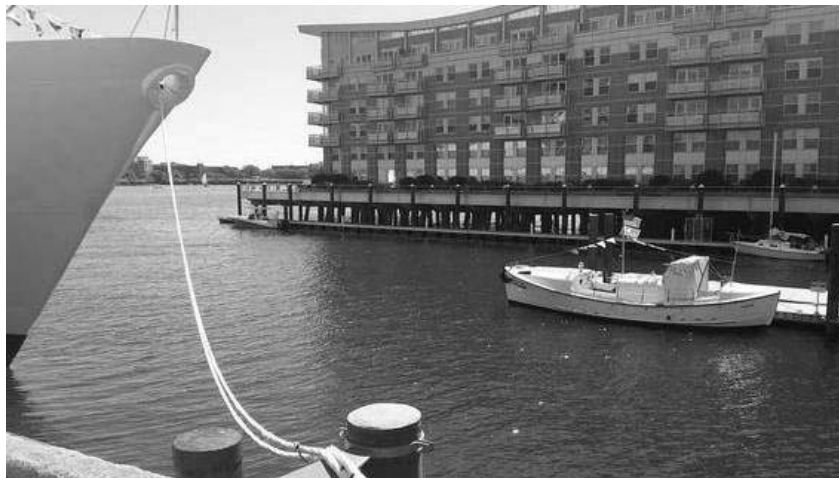
CG36500 appears tiny as the bow of USCG JAMES looms in front.

On Sunday, we were scheduled to make our return trip across the bay to Orleans, but the weather was blustering from the northeast. As soon as we left Boston harbor we started to take on waves that were breaking over our bow, which would have made for a slower and more dangerous crossing. So we changed course and headed down along the South Shore coastline. The waves were now off our beam and the boat was really rockin’ and rollin’.