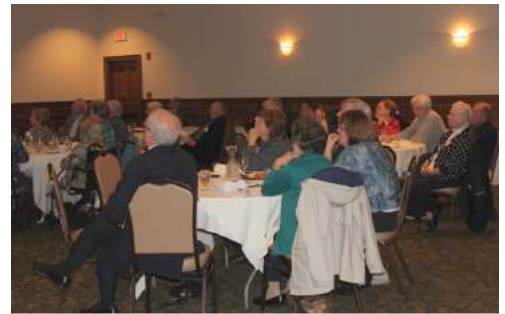
Members listen intently during the OHS Annual Membership Meeting