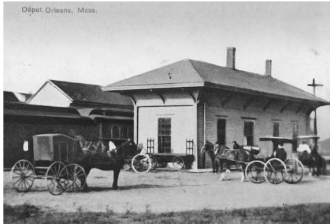
Early postcard showing a train at the Orleans depot, located across Old Colony Way from the current Chocolate Sparrow.

In addition to passengers, the line carried freight -- more incoming than outgoing. In 1871, total freight carried by the Cape railroads was approximately 13,000 tons of iron and other ores, 11,000 tons of less-than-carload merchandise, 6,000 tons of agricultural products (grain, flour, feed), 5,000 tons of coal, 2,000 tons of building materials (lumber, stone, brick, cement and sand), 600 tons of livestock and nearly 6,000 tons of “other” items. Going off-Cape were sand, barrels and boxes of fish, crates of textiles and, eventually, cranberries.