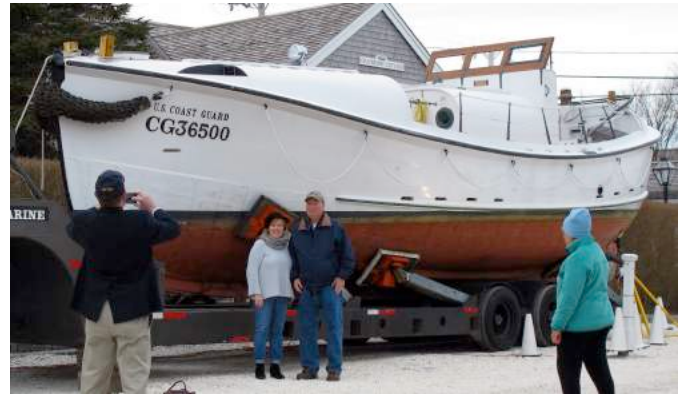
Visitors take photos of CG36500 outside Chatham Bars Inn.

The special screening was just one of several events sponsored by the Chatham Bars Inn and others that night, held to benefit the Orleans Historical Society (OHS) and the Coast Guard Heritage Museum in Barnstable. Tickets were offered to the public earlier in January for $95 each, and sold out within hours. Simultaneously,