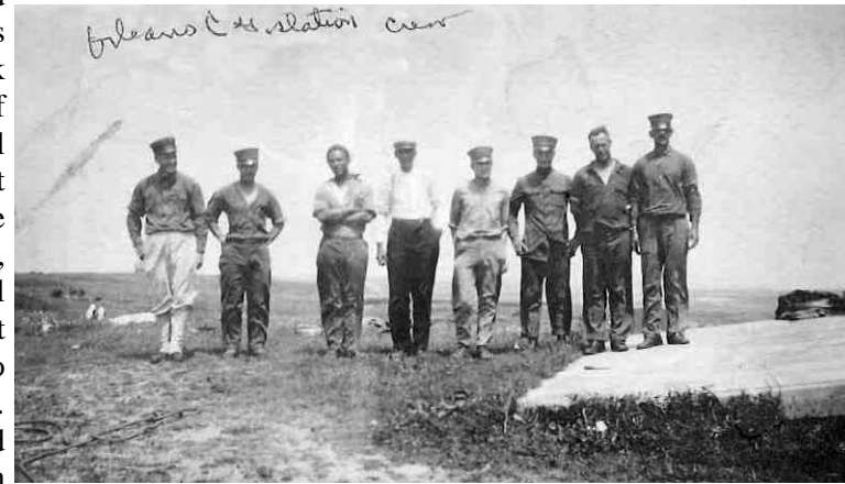
Orleans USCG Station No. 40 crew

The Orleans Life-saving Station no longer exists. One of the original nine stations erected by the USLSS in