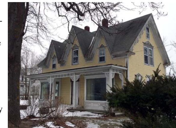
Albert Bassett house, 116 Cranberry Highway

discussing the lease or sale of town-owned property adjacent to the Meeting House, and possibly moving a circa 1800 barn and 1880 house (both currently empty) to that location. These buildings, conveniently clustered together, would provide much-needed space for the proper preservation and public display of Orleans historic items well into the future.