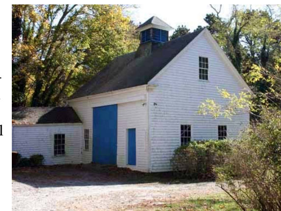
Sparrow Barn, MA-28/So. Orleans Rd