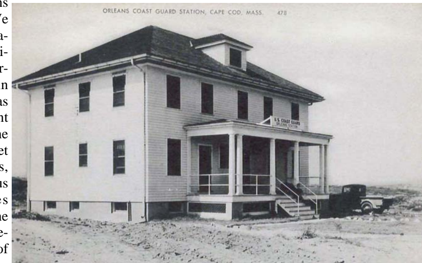
U.S. Coast Guard Station No. 40, Orleans