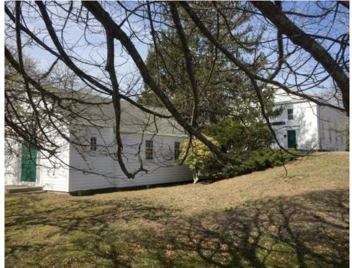
View from the corner of River Rd. and School St. of Hurd Chapel (left) with Meetinghouse in background.

For that purpose he noted improvements that should be made to the Meetinghouse to create a handicap access and bathroom; update the heating ductwork, emergency lighting, fire protection and other mechanical systems; and securing loose floorboards. In addition, he recommended restoration projects such as replacing the front doors with historically accurate reproductions, adding external louvered shutters on windows and replacing the poured concrete platform outside the main entrances with a new slab covered with period stonework.