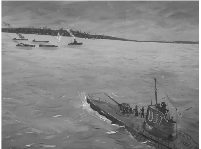
This mural depicts the artist's interpretation of the dramatic WWI submarine attack on barges and a tow-boat off Nauset beach in 1918.

An early Orleans baseball team jersey is one of the artifacts from the OHS archives that will be on display this summer at the Meetinghouse Museum.