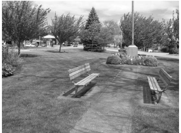
Rock Harbor Academy site viewed from Main St. toward Rte. 28 (left) and Academy Place (right).

The same patch of land that housed Rock Harbor Academy also became home to the Snow Library in 1877. Watch for that story in a future column.